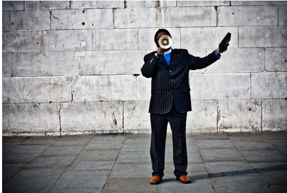
"With A Megaphone By A Wall" by garryknight is licensed under CC BY 2.0 .