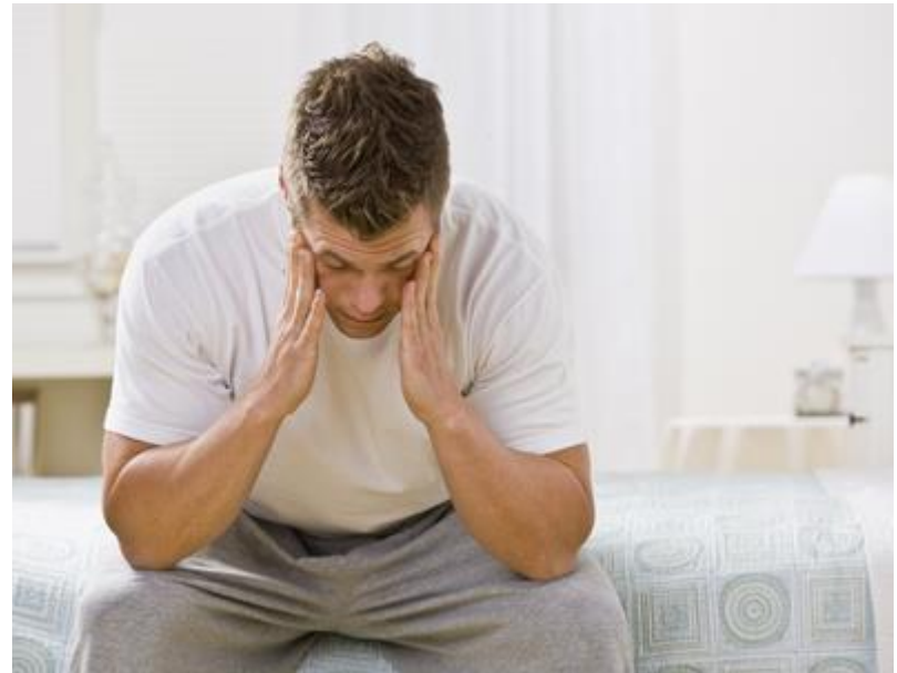
"Tired Man Sitting on Bed" by Mic445 is licensed under CC BY 2.0 .