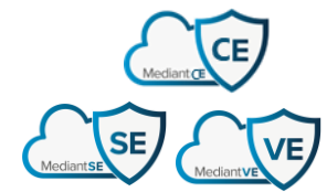
Virtual / Cloud-native SBCs