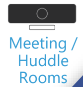
Meeting / Huddle Rooms