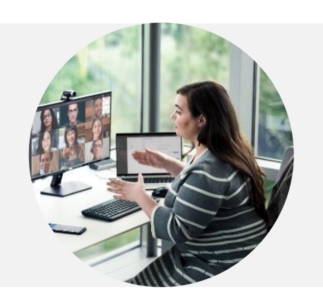
Enable Microsoft Teams, including Teams Rooms, Teams Phone, and events