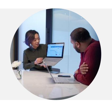
Migrate data and ensure application compatibility